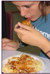
~ Always lots of food ~

The complete program is spread over three summers; year 1 the basics; year 2 advanced missions; and year 3 is mainly leadership training for leading future short term teams.